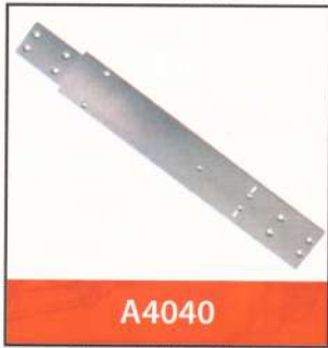
Plate motor 马达固定片